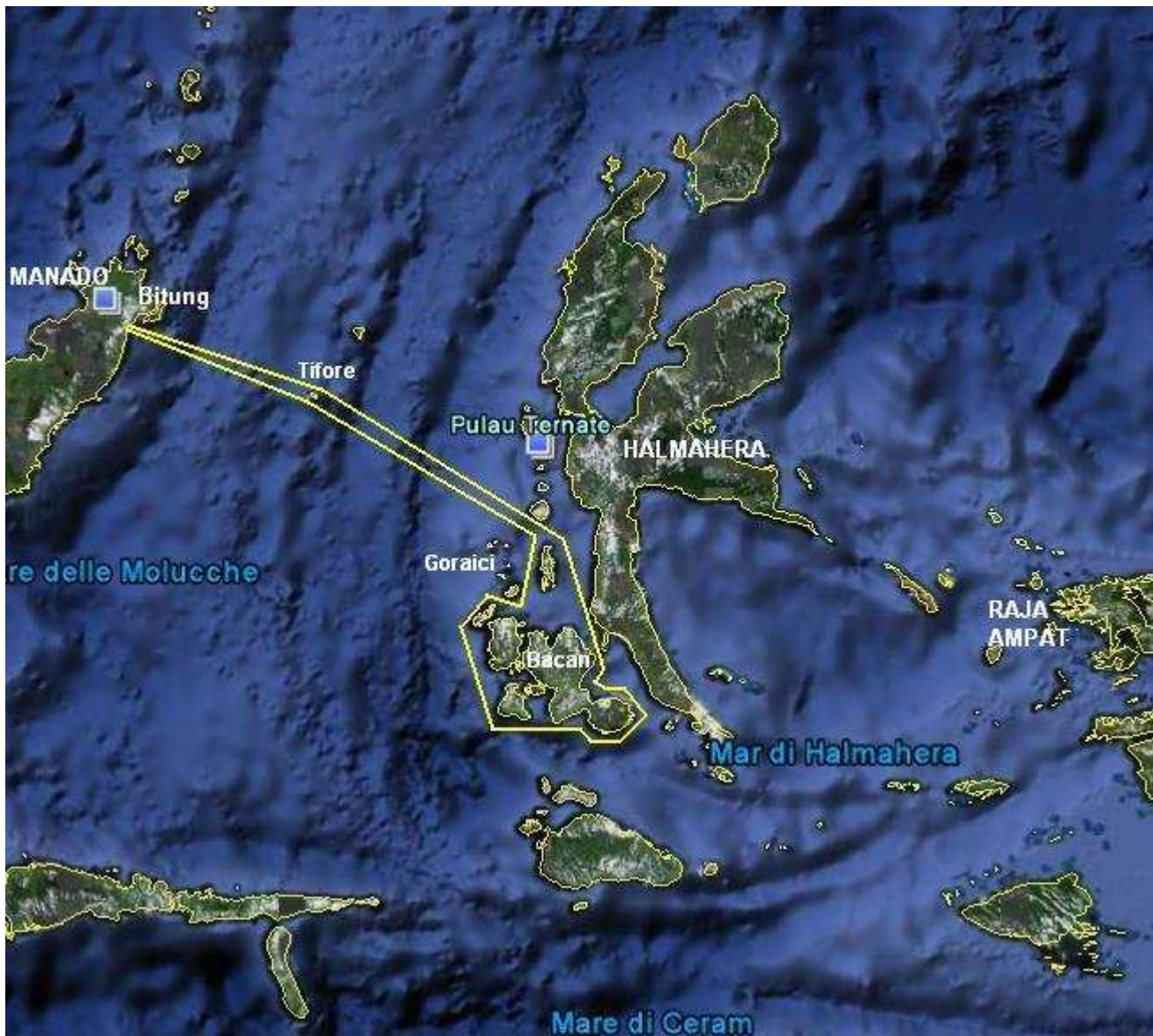
Halmahera, Goraici and Bacan

GO TO THE HOME PAGE OF: WWW.CRUISEINDONESIA.COM TO SEE ANOTHER INDONESIA DIVE SITES