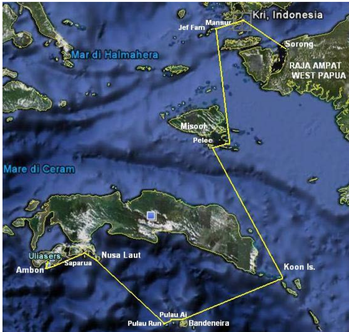
From Banda To Raja Ampat

GO TO THE HOME PAGE OF: WWW.CRUISEINDONESIA.COM