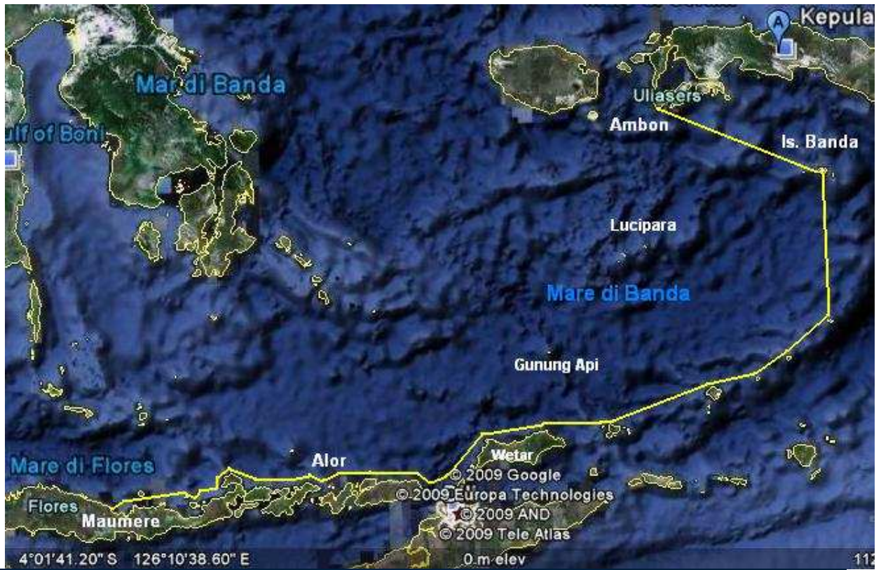
Flores and Banda Sea. From Maumere to Ambon

GO TO THE HOME PAGE OF: WWW.CRUISEINDONESIA.COM