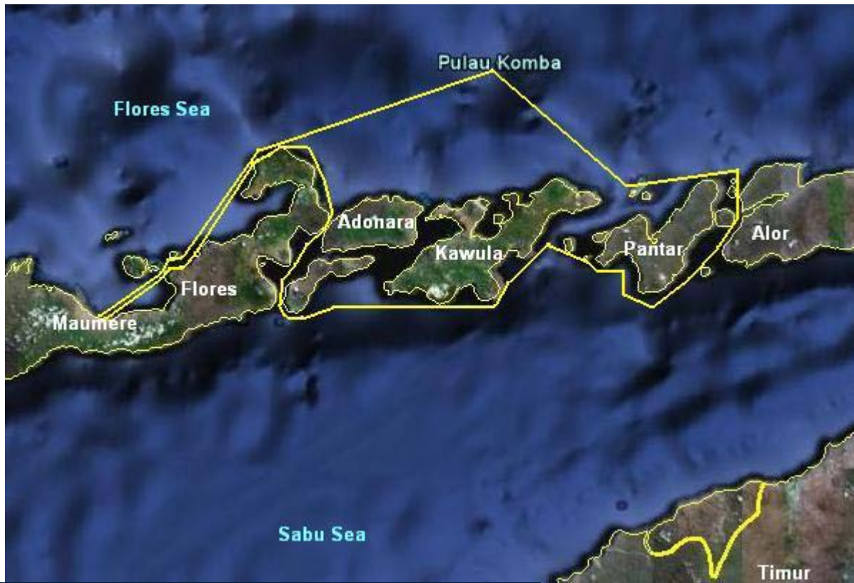
Flores and Alor